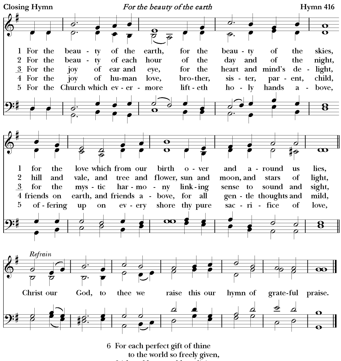
to the world so freely given, faith and hope and love divine, peace on earth and joy in heaven,